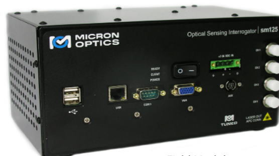
sm125 Field Module

The Micron Optics “sm - Sensing Module” platform responds directly to the user commands of the optical interrogator core and outputs sensor wavelength data via Ethernet port and custom protocol. All module settings, sensor calculations, data visualization, storage, and alarming tasks are run on external pc or sensor processor module. The Sensing Module platform is ideal for custom, client developed system management tools, but is equally compatible with local or remote installations of Micron Optics ENLIGHT.